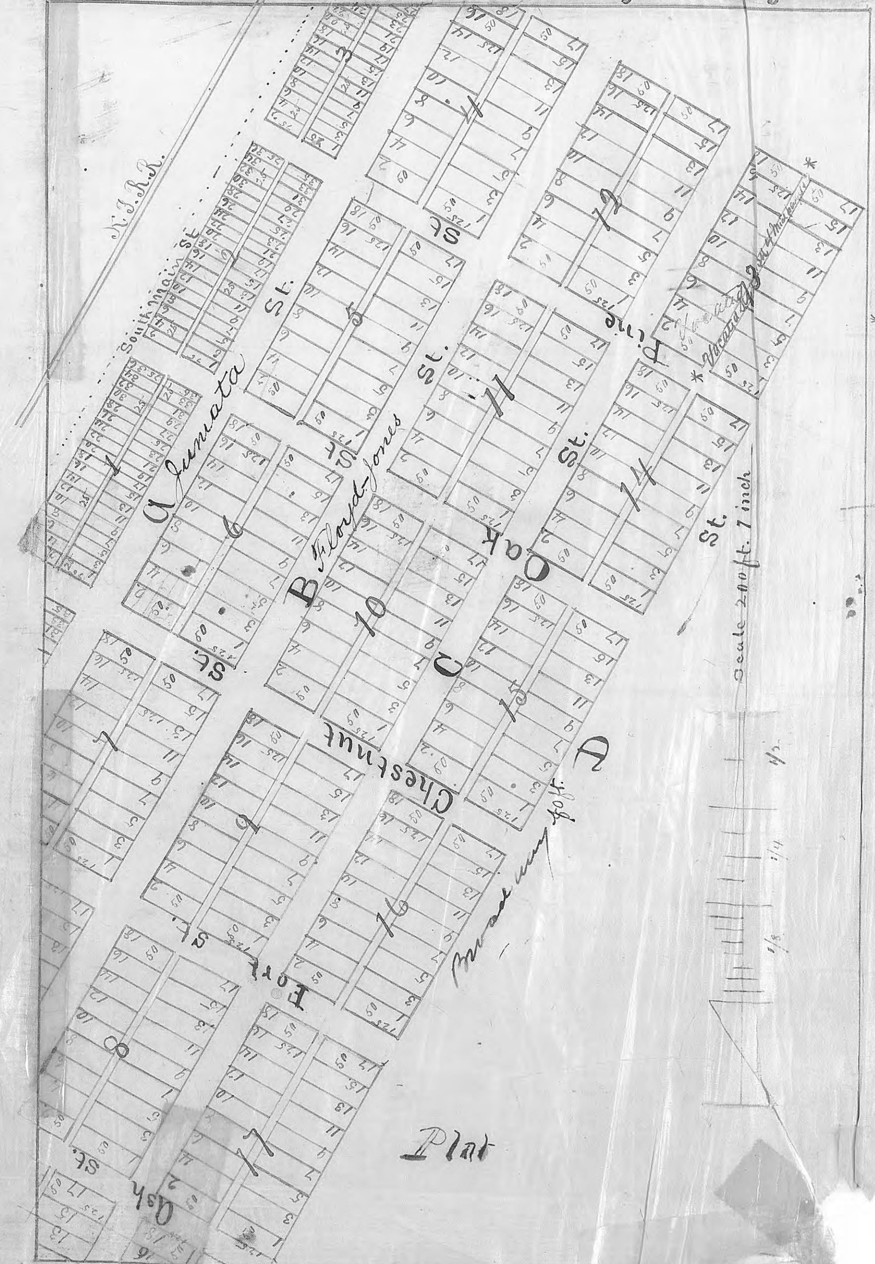
WILSON'S ADDITION to Hays City